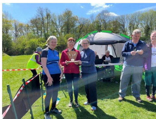
WRE, Veteran Women