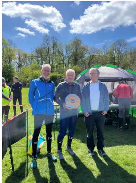
WRE, Super Veteran Men