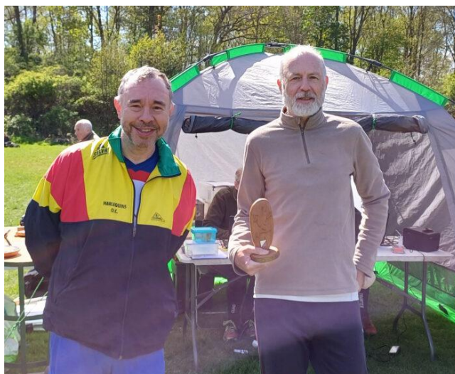
2/3 of HOC's winning Veteran men