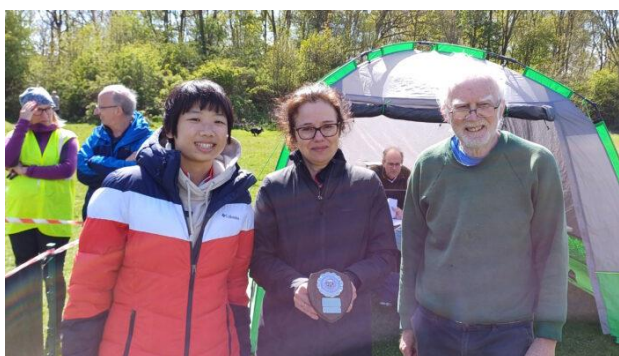
HOC's winning AdHOC team