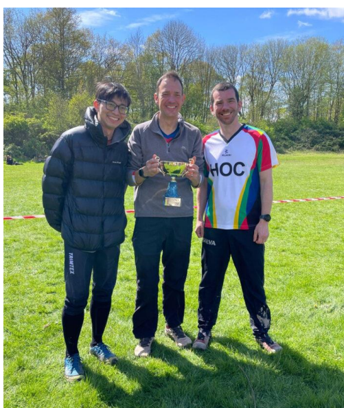
Men's Open winners