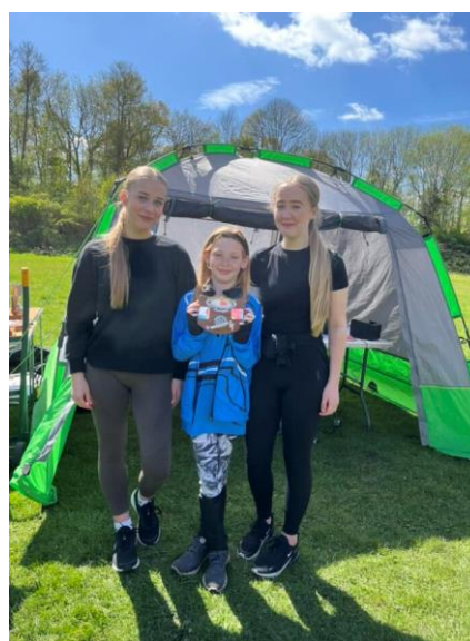
WRE, Junior Women