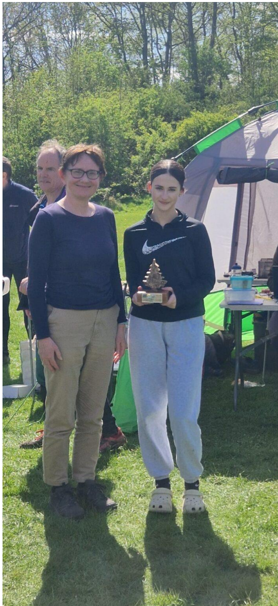
POTOC's Senior Women