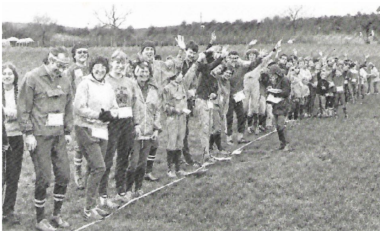
The start of the 1st TSB Trophy event at Telford Town Park in 1984