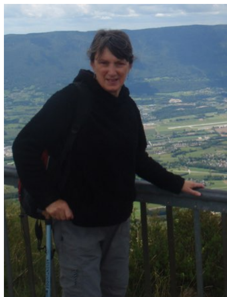
WOC 2011 France

Her main motivation for getting to events was to catch up with friends and acquaintances as she liked nothing better than finding out about people and their families. She seemed to have an extensive knowledge of the orienteering scene, both at home and abroad, and followed the British Team as best she could on social media and with a last big trip to the World Championships in Scotland in 2015. Increasing problems and regular hospital visits curtailed the big trips but she remained interested and active on the local scene and was still planning further excursions which, sadly, were not to materialise.