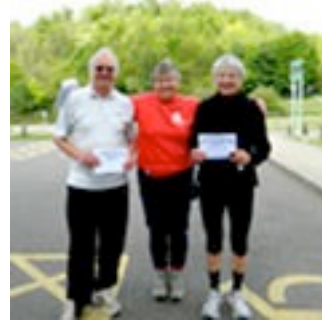
2013 Winners at Hanley Forest Park