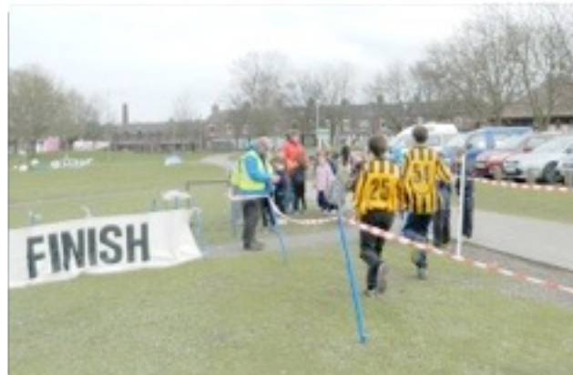
The Finish at Hanley Forest Park