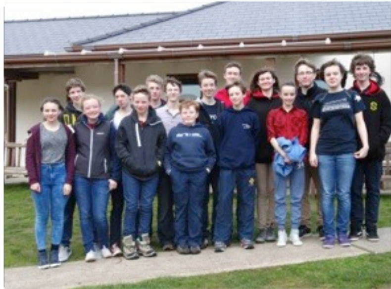
WMJS at The Gower February 2014

towards the trip to Sweden, for which we are really grateful. We will be doing an OD quiz in March to raise funds for the Swedish trip.