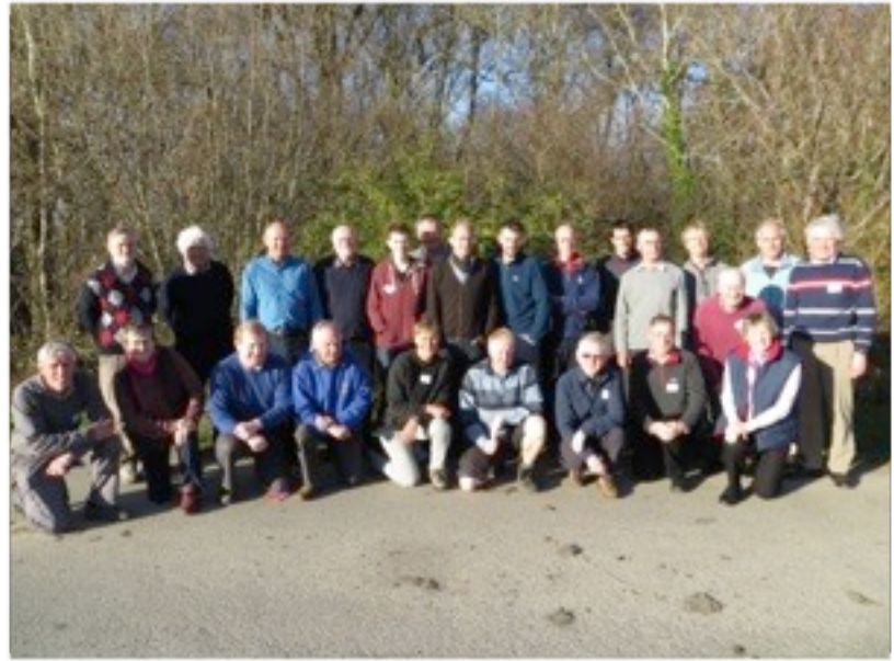
OCAD 11 Workshop Participants